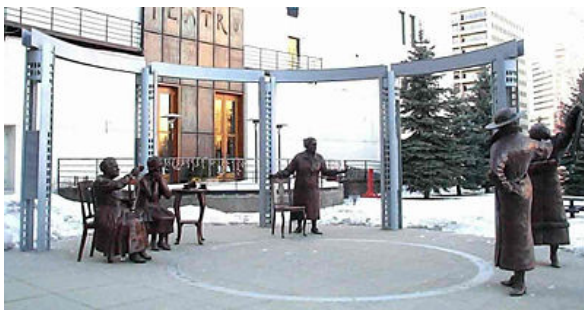
This Statue of the "Famous Five" is in downtown Calgary.

In April of 1928, the Supreme Court of Canada ruled that the word "person" in the British North America Act did not include a female person. An individual had to be 'fit and qualified' to hold public office and a woman was not. Five Alberta women – Henrietta Muir Edwards, Nellie McClung (member of the Alberta Legislative Assembly ), Louise